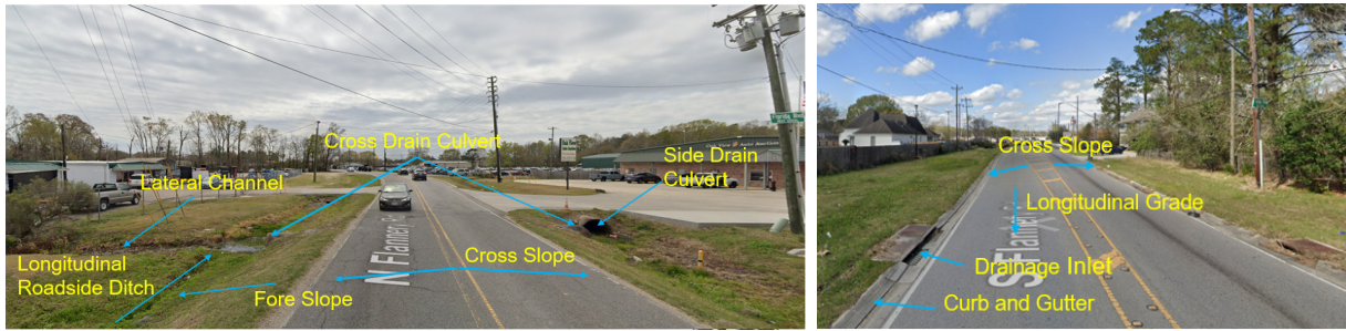
Figure 2. Pavement drainage system

cost-effective and less risky to prevent moisture from entering and accumulating within pavements using surface drainage than it is to rely on subsurface drainage for moisture removal.