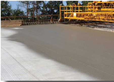
This image shows a 150 pcy ICC mixture deck placement the following morning after the construction crew left. This illustrates why ICC is a good option as the absence of cracking in this section indicates that the ICC plays a large role in the future durability of the short non-cured section.

As the research team presented their progress at several industry events, the proposal sparked the interest of Mitchell Wyble, P.E., former LCG city/parish engineer. At the time, Wyble was looking for an innovative way to increase the longevity of concrete bridge projects. “After having a conversation with Tyson, I then reached out to municipalities in the northeast and midwest to see how they were using lightweight aggregate,” said Wyble. “After doing external research and talking with other municipalities, I decided it was the right thing to do,” said Wyble.