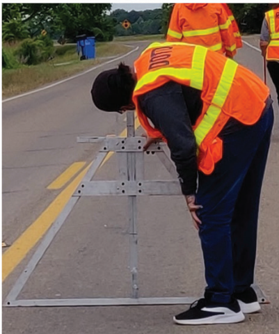
Construction and distress survey of the test sections during field experiment