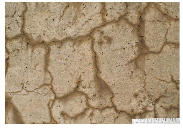
Figure 1 Premature deterioration of concrete caused by alkali-silica reaction

Researchers developed the miniature concrete prism test (MCPT) to shorten the time required to determine the expansion