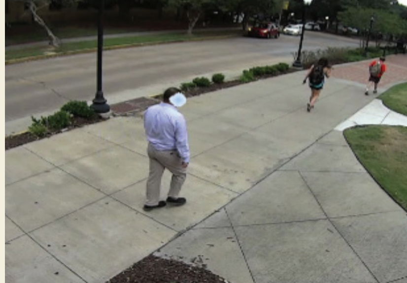
Pedestrians at Site 5 LSU Student Union

count locations," said Tolford. "This included infrared sensors, which can be installed on shared-use paths or sidewalks to count the total number of users in either direction. It also includes pneumatic tube counters for use on bike lanes and shared roadways, which are able to detect bicyclists based on the weight and axle distance of the vehicle as it passes over the tubes. In addition, the team that worked on video-based counts used portable video cameras and sought to develop algorithms to extract the necessary data."