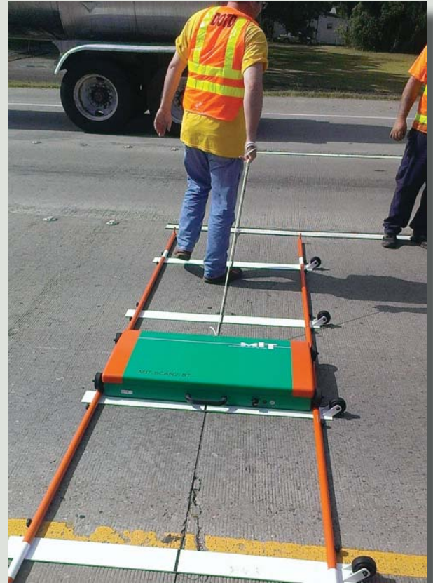
Figure 1 MIT-SCAN 2 -BT

The MIT-SCAN 2 -BT device is very capable of locating and measuring dowel bars and assemblies. It is also capable of determining whether or not a bar is missing, or if the load transfer device is something other than a dowel bar. The results also indicate that the effect of longitudinally translated dowel bars is negligible. Acceptable long-term performance was observed in joints with less than 4 in. of embedment and some joints with 2.5 to 3 in. of embedment. The Department's current dowel placement specifications lead to acceptable long-term joint performance.