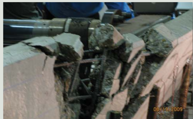
Figure 2 Barrier after failure