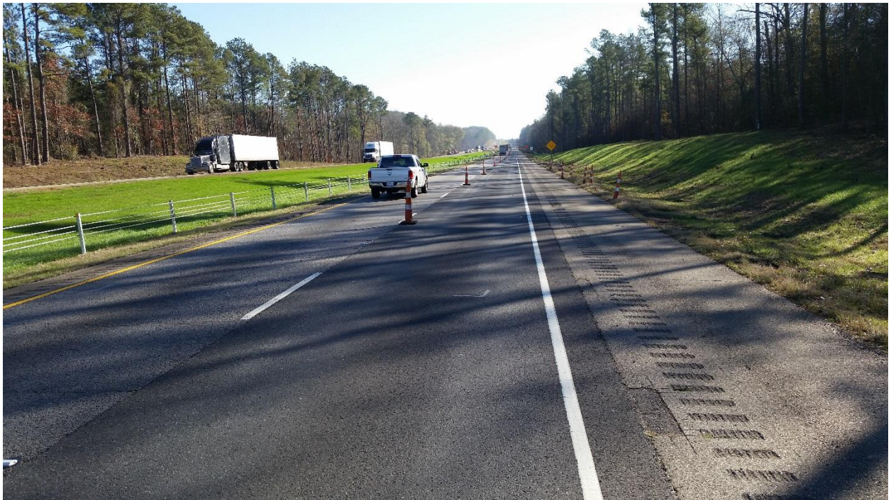
Figure 2 I-20 eastbound lane rutting