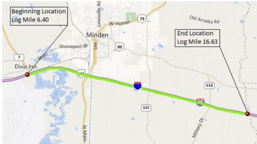
Figure 3 State Project No. 451-03-0040 location