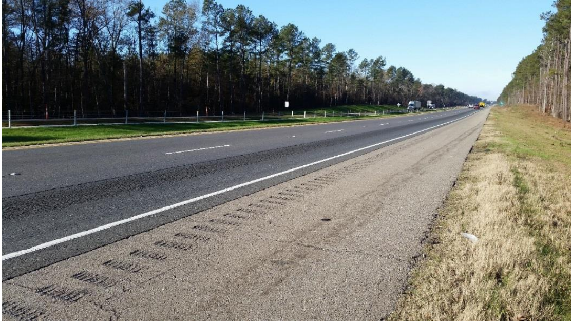
Figure 1 I-20 westbound milled outside lane