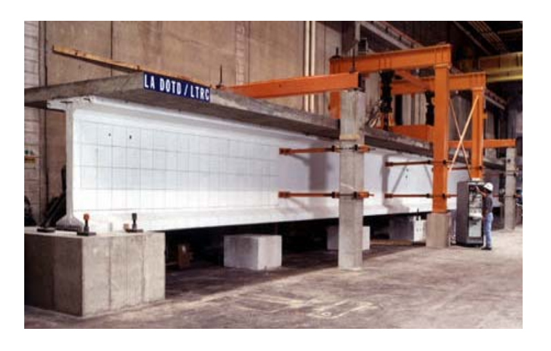
Fatigue Test Setup

The five prestressed concrete girders were produced in a commercial plant. Prior to testing, a 10-ft. (3.05-m) wide reinforced concrete deck slab was