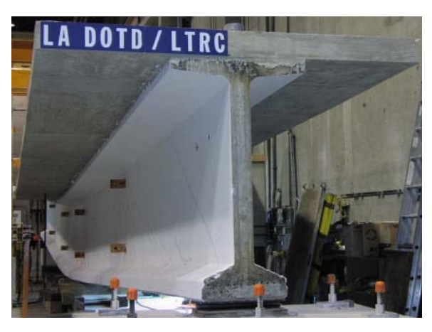
Full-size Bulb-Tee Girder Test

$14,688,267/$1,304,373 \rightarrow B/C = 11.3:1