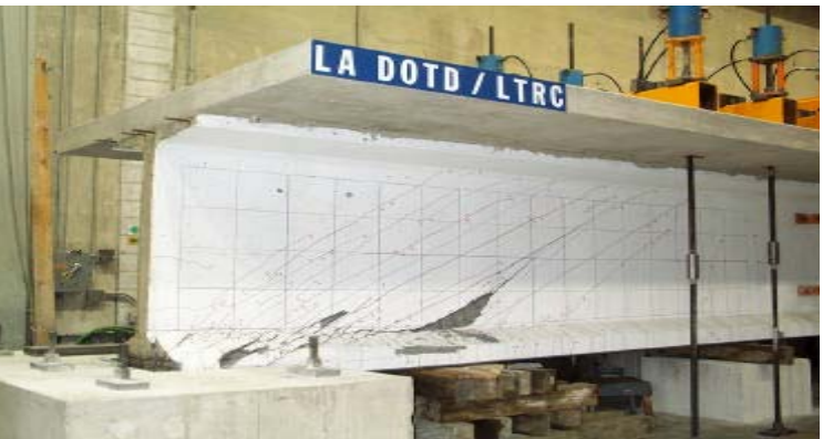
Shear Test at CTL